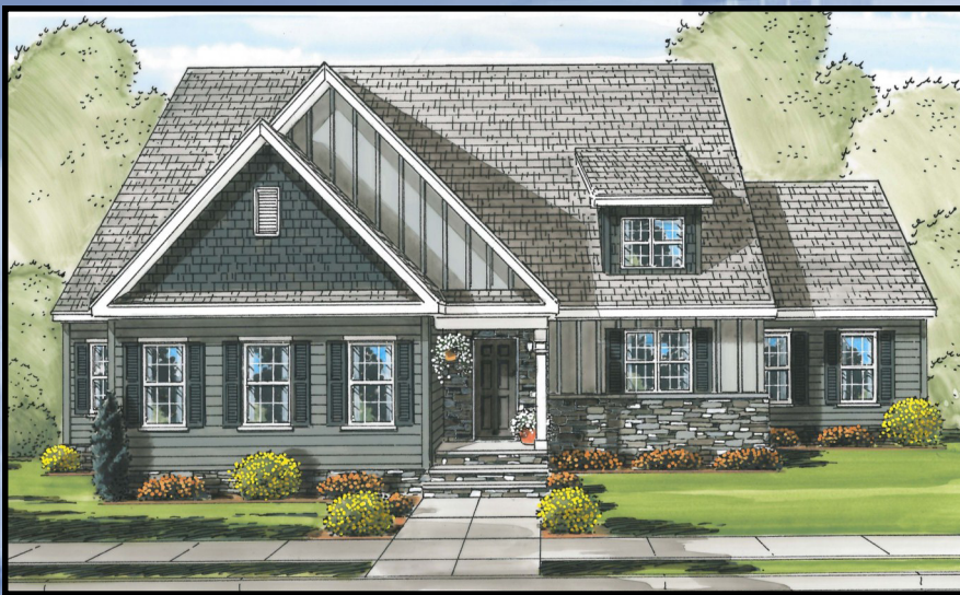
Stone Accent Completed OnSite By Others.