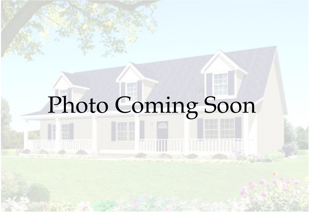
Photo Coming Soon