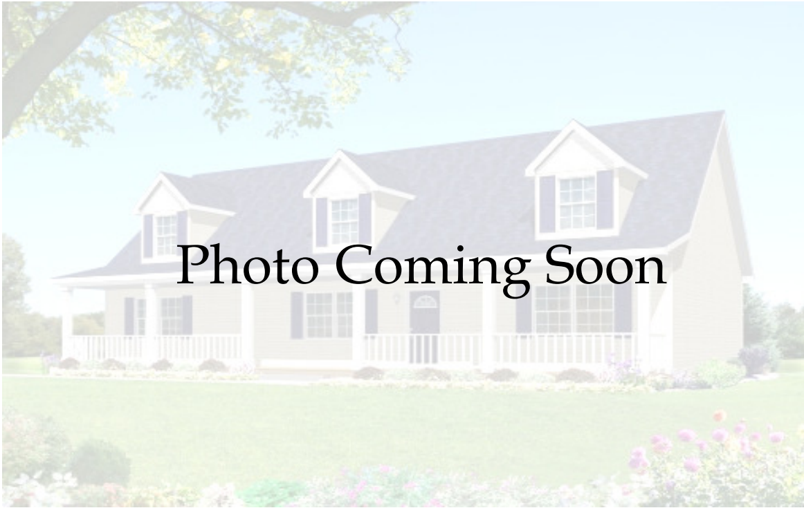
Photo Coming Soon