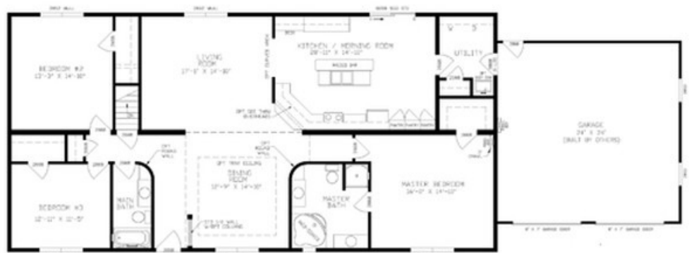
AUBURN II PLAN No: RW3203 31'4" x 64'0" 2005 SQ. FT.