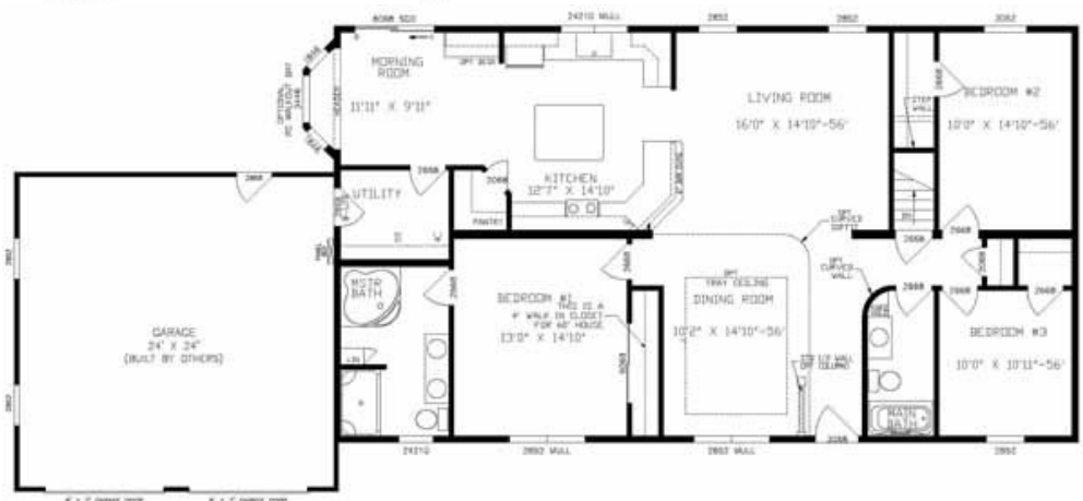
BRISTOL IV PLAN NO: RW3201 31'4" x 60'0" 1880 SQ. FT.