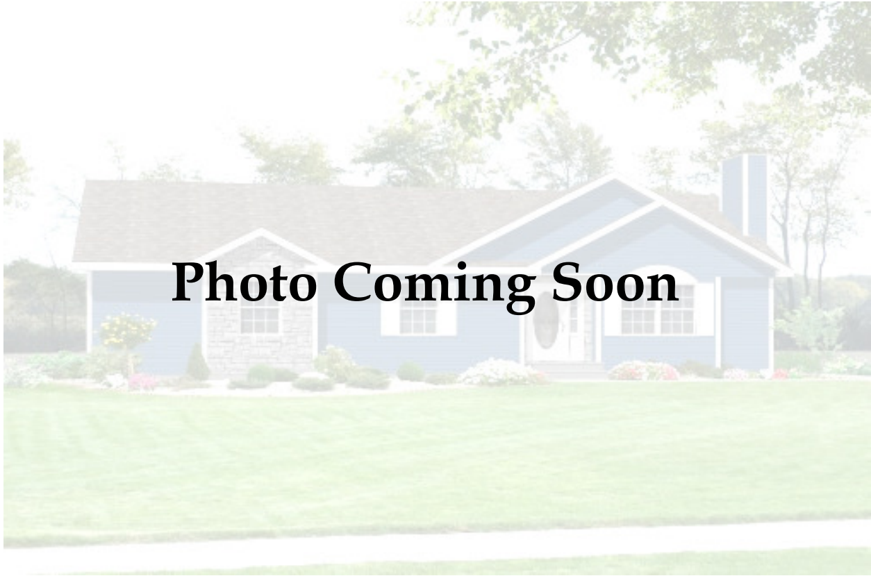
Photo Coming Soon