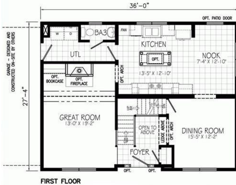
LONE STAR PLAN NO: NS309A FIRST FLOOR 28" x 36'0" 1961 SQ. FT.