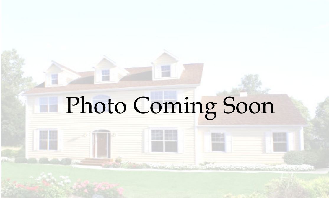
Photo Coming Soon