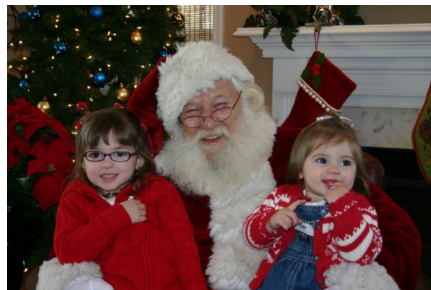
Local children get their picture with Santa Claus. December 2009.