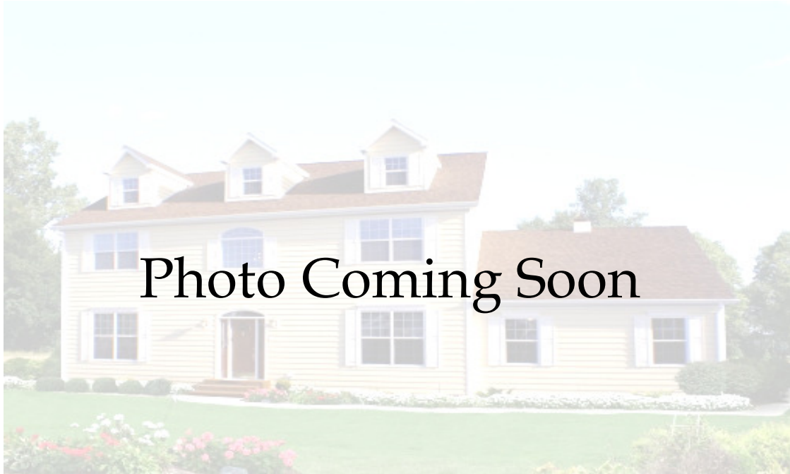
Photo Coming Soon